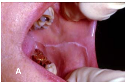
Figure A: The whitish line is a common lesion that develops as a reaction to pressure of the soft tissue against the teeth. This readily identifiable lesion is termed linea alba (white line) and has no potential for cancer.

How are oral lesions detected? Premalignant lesions and early cancers are usually asymptomatic (ie the patient has no pain and they don’t even know they have a lesion), so their detection is contingent upon a careful soft tissue examination by a dentist. This examination must include the inside and outside of the lips, the cheeks (buccal mucosa), the sides and undersurface of the tongue, the floor of mouth, the gums, the roof of the mouth (palate), the back of the mouth/top of the throat (oropharynx). Most oral lesions are traumatic in nature and have no potential for cancer (Figure A). However, some oral lesions have an appearance which may raise suspicion by the dentist.